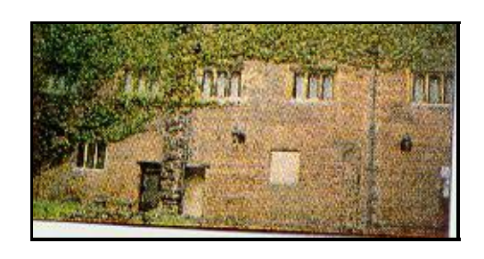
The Cockpit gallery 1997

On 27 January 1697 Edward paid £32 for 2 black horses.